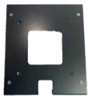
VESA adapter plate 1 pc